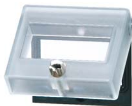
Transparent cover with key lock